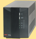
Power Conditioned UPS